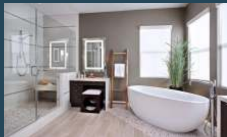
PREMIUM QUALITY BATHROOM