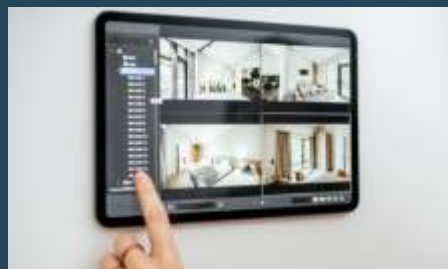
DIGITAL CONTROL SYSTEM