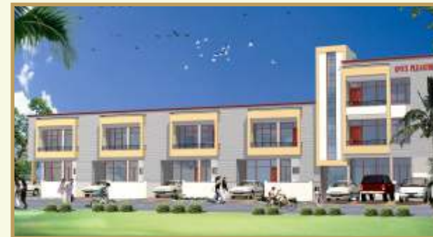
ONYX PLEASURE (SOLD) 236-239 KHUSHI VIHAR