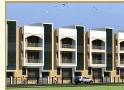
ONYX HARMONY 145-150 KHUSHI VIHAR