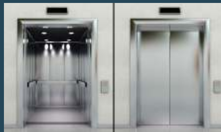
HIGH SPEED LIFT