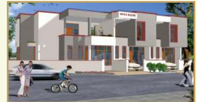
ONYX ELITE (SOLD) 129 KHUSHI VIHAR