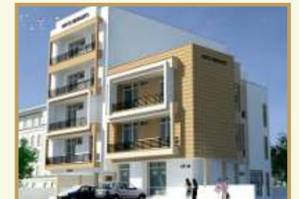
ONYX HEIGHTS CD 50-51, DADUDAYAL NAGAR