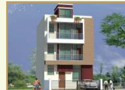
ONYX FLOORS 39, 43, 46 KHUSHI VIHAR